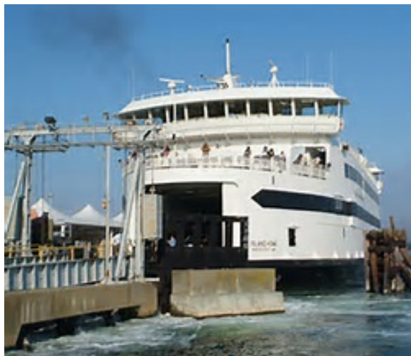
The ferry between Woods Hole and Martha's Vineyards