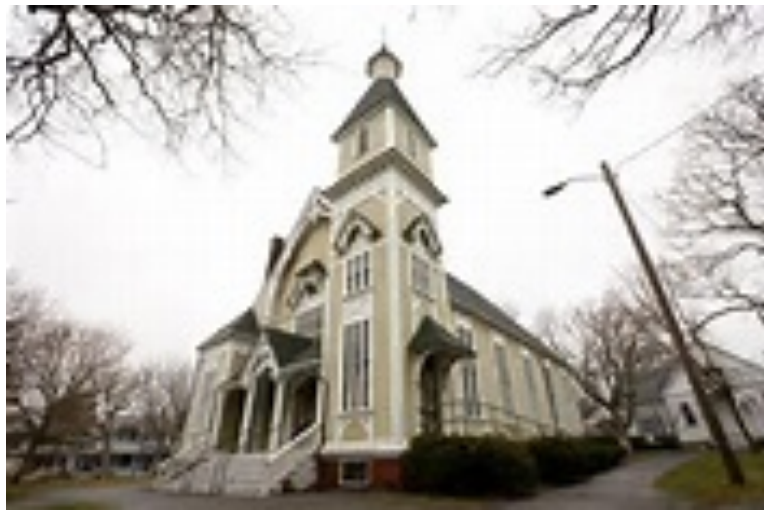
The Trinity Church at Oak Bluffs