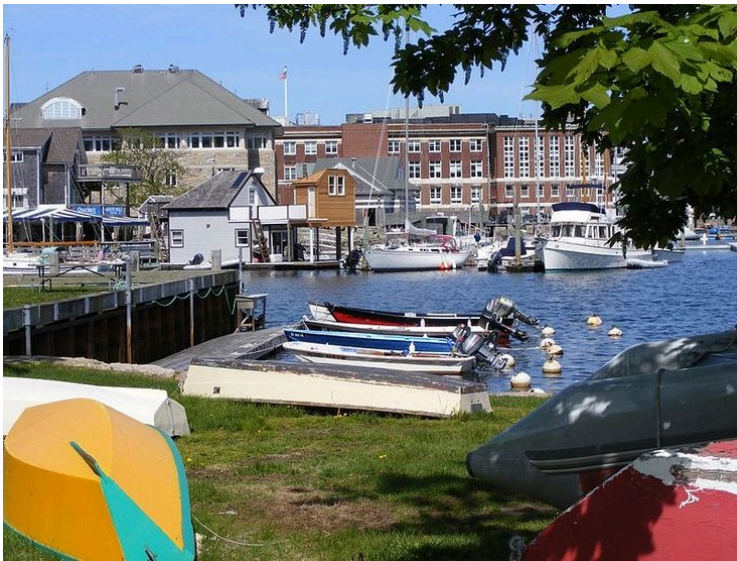
The Eel Pond at Woods Hole

I held a job at the Oceanographic Institute in Woods Hole over the summers of 1955 and 1956. The last time I'd visited there was in 1960.