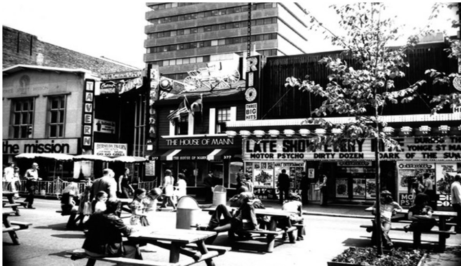
The Yonge Street Mall

THE MALL is a long stretch of Yonge Street in downtown Toronto. For the past two years it's been turned into a pedestrian mall. Now it hosts a permanent carnival atmosphere.